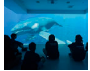
Projection mapping in the theater room

Sakura-Shinmachi, where our Setagaya school is located, is the town where the manga artist, Hasegawa Machiko, once lived. Hasegawa Machiko Memorial Museum, Hasegawa Machiko Art Museum, and bronze statues and illustrations of “Sazae-san” can be found throughout the town. Setagaya School is located on a shopping street named “Sazae-san Street,” which retains a nostalgic atmosphere. On the other hand, Sakura-Shinmachi has a history of being the first suburban residential area in Kanto , and houses were sold under the promotion of “Karuzawa in Tokyo” in the early Taisho period. That time, it was a highly advanced residential area, with electric lights, telephones, sewage systems, and later, the establishment of a Police Box. Sakura Shinmachi, with its spacious, well-planned, and affluent neighborhood, combined with the homely atmosphere depicted in Sazae-san, continues to be a highly popular residential area even today.