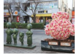
Sazae-san statues at the west exit of Sakura-Shinmachi Station