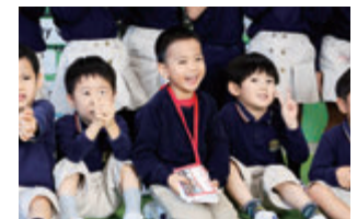
On his last day at Dojima School, he was presented with a mini album with messages from his friends and photos of his memories!