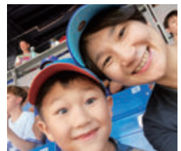
Watching a game of Shohei Ohtani at Rogers Centre, the home stadium of Toronto Blue Jays.