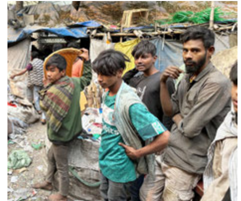
Slum boys living off gathered rubbish

In a home I visited in a slum area, I met a family of four living in a cramped space, barely six tatami mats in size, which included a kitchen and toilet. Many fathers work as bicycle rickshaw drivers, but half of their earnings are taken by the area controllers, leaving them with minimal income to support their families. Mothers contribute to the family income through home-based work, enabling them to afford housing in the low-rent area of the slum. For homeless people, having a roof over their head, even in such modest dwellings within the slum, represents a significant step forward and becomes one of their goals.