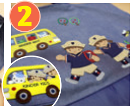
Kinder Kids students, along with phonics characters, are joined by fami-chan from familiar!