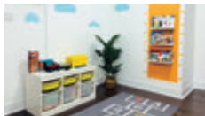
Toys, picture books, and other children's items are available for use.

We also provide toys, children's tableware, and mealtime booster seats, sparing families from bringing these items from Japan.