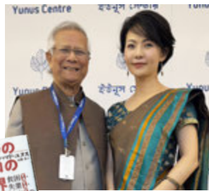
(Above) Meeting with Dr. Muhammad Yunus at Yunus Centre in Dhaka (Left) "A World of Three Zeros" by Muhammad Yunus

I read Dr Yunus's book " A World of Three Zeros: The New Economics of Zero Poverty, Zero Unemployment, and Zero Net Carbon Emissions " and was deeply impressed. I had the chance to visit Bangladesh because my son was involved in activities there. Through this trip, I was able to better understand the activities he is involved in and learned about the local approach to education and social issues.