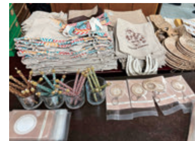
Handmade products from Ekmattra Handicrafts, made from traditional jute fabric and special stones used in traditional Bangladeshi attire.

Kinder Kids has devised a plan to place regular orders for cloth bags and other products from Bangladesh, to support and strengthen its textile industry. We hope that this initiative will provide a stable source of income for local women and contribute to more ecologically sustainable employment opportunities .