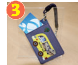
The pass case is perfect for storing the blue card.