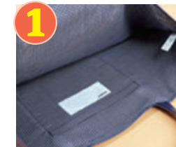
A wide bag that can accommodate B4-sized documents, complete with a gingham check lining.

These items are certain to be practical for school or after-school activities!