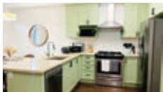
The spacious kitchen allows you to enjoy cooking during your stay.

We have prepared the "Kinder Kids Guest House in Canada" to offer families participating in the "Global Transfer" Program a safe and comfortable place to stay. This eliminates the need for parents to search and book accommodations on platforms like Airbnb. Situated in a peaceful residential area, our guest house is conveniently located just an 18-minute drive from Oakville School and a 20-minute drive from Clarkson School.