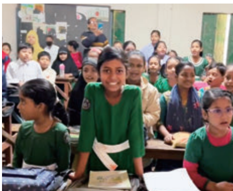
Bangladeshi children are genuinely enjoying their time at school

Mae Watanabe is dedicated to supporting impoverished women, offering handicraft workshops to provide employment opportunities for underprivileged women. She is actively contributing to society, together with her husband, Taiki.