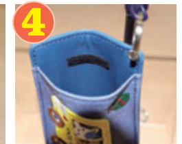
Velcro (hook and loop fastener tape) ensures that the cards remain securely inside.