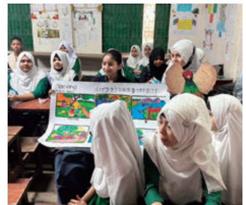
Bangladesh is one of the countries with a strong affinity for Japan. Students introduced Bangladesh using the Japanese they had learned.